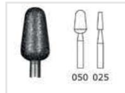
Aluminium-oxide grinding bit (pink)

1 piece 2.3mm. For the treatment of corns and cornea.