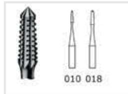
Cross-cut fissure burs

2 pieces each 0.9 – 1.4 and 2.3mm. For work on nails. For the treatment of corns.