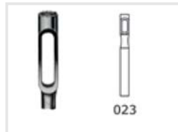
Long hole cavity cutter

1 piece 2.3mm. For the treatment of corns and cornea.