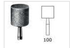
Specialty grinding bit (white)

1 piece each bullet (5mm) and cone (2.5mm). For cornea and nails.